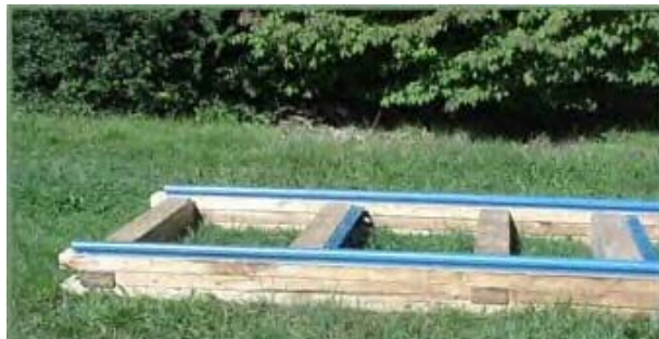
XL4 carriage base - Schedule 80 pipe welded to 1/8" slotted flat stock